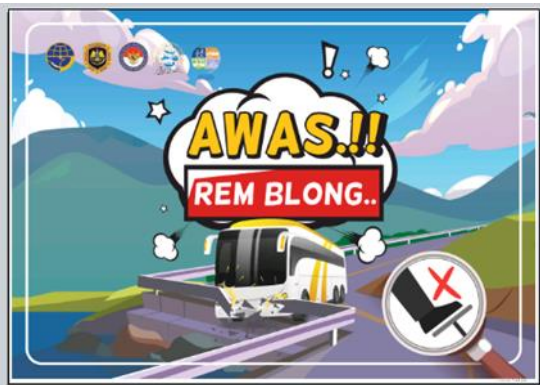
Pocket Manual Book: "Caution, Sudden Brake Failure" (July 2020)