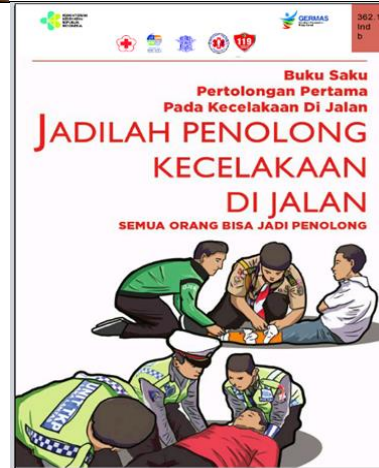
Pocket Manual Book: "Be an Accident Helper on the Road" (Februari 2020)